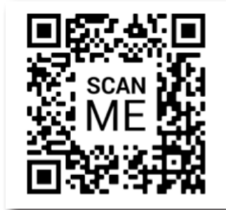
For more information Please scan the QR code

The Marine Corps Resource Center provides information on local area, programs and services, and outside referrals.