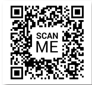
For more information Please scan the QR code

The EFMP supports the continuum of care for all eligible sponsors and their family members in order to improve the quality of life for families that support a member with special medical and/or educational needs. EFMP staff and families work together to inform, educate and empower individuals to be the best advocate for themselves and/or their family member(s). The EFMP is a DOD-mandated enrollment program designed to support individual, family and unit readiness.